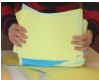
Eliminate bad preparation e.g. for professional...